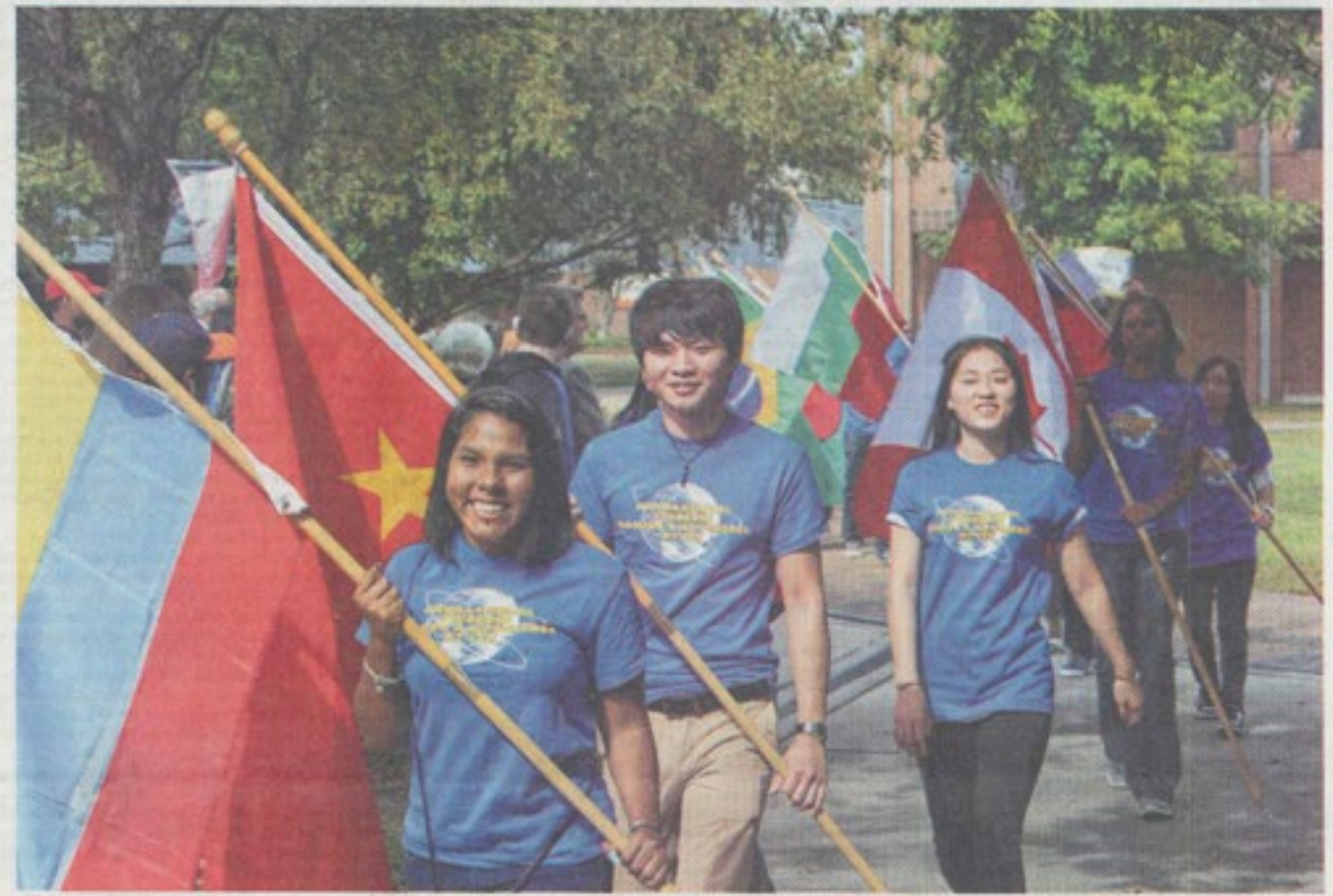
Tallahassee Community College students display flags from their home countries to kick off the college's international Education Week, promoting the benefits of international education and exchange. Today at 1 p.m. in the University Ballinoom guests can visit students representing countries from around the world. Thursday at 11:30 a.m., there will be a screening of the movie "The Dialogue." Thursday from 2:30 to 5 p.m., "An Afternoon in the Tropics" on the Campus Walkway offers a chance to "visit" some of the Caribbean countries represented on campus. Friday, booths in the student union will provide information about more than 80 countries.