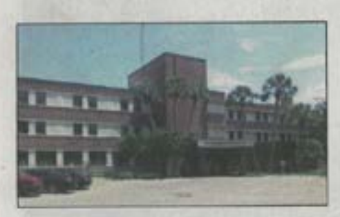
The W.A. Woodham Justice Center