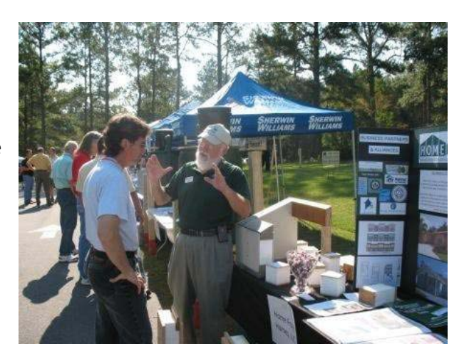
Residents check out the displays at the 2008 Green Living Expo. The event is back this Saturday and will feature an even larger array of exhibits, organizers say.