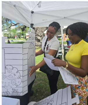
Bring a Friend