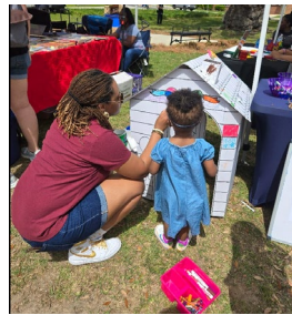
Bring Your Child