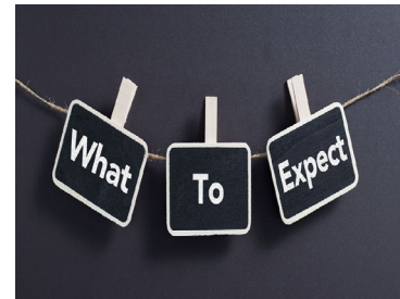
Provide More Details